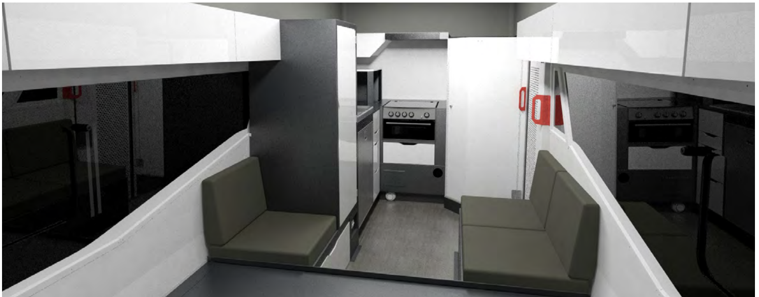
*PICTURED WITH OPTIONAL WARDROBE (LHS)

TI* "TRACK INNOVATION", refers to specifically engineered solutions, now appearing for the first time, as part of the T4 Collection. Naturally, in addition, many earlier Track Innovations are carried forward from other Track products.