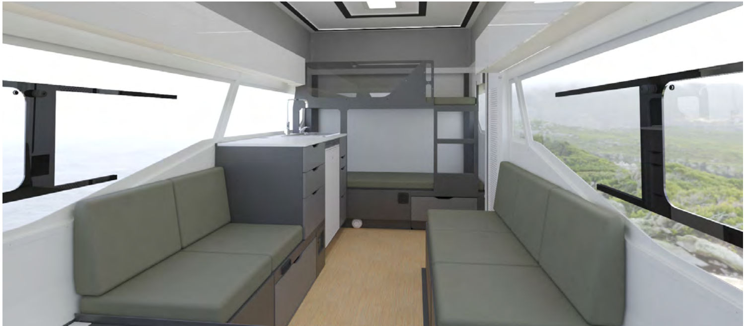
*PICTURED WITH OPTIONAL SET OF DRAWERS (LHS)

TI* "TRACK INNOVATION", refers to specifically engineered solutions, now appearing for the first time, as part of the T4 Collection. Naturally, in addition, many earlier Track Innovations are carried forward from other Track products.